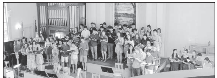
The campers and instructors performing excerpts from Monteverdi's Vespers