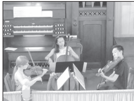
String Trio opening a service

It was another successful and tuneful summer with the campers of Greenwood Music camp. They played for us, they sang for us and they rang the bell! Their presence brought in a lot of visitors who got to enjoy the beauty and hospitality of the Village Church. We are so fortunate to have this blessing in our community.