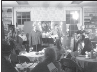
Photos from performances last season

Friday Night Café cummingtonvillagechurch.org/FNC.html