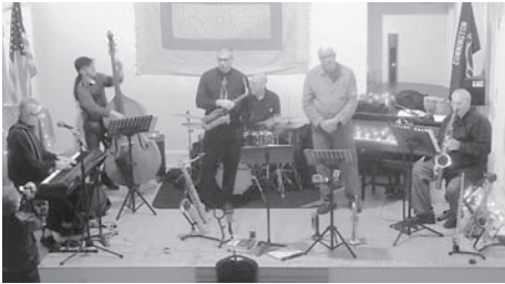
Last year's line-up of fine musicians..

Don't forget your berets and volumes of existential poetry!