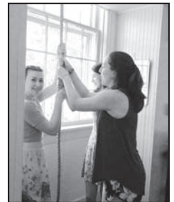
Campers loved to ring the church bell