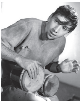
Maynard G. Krebs

In the spirit of Maynard G. Krebs, the Bryant Free Library presents, once again